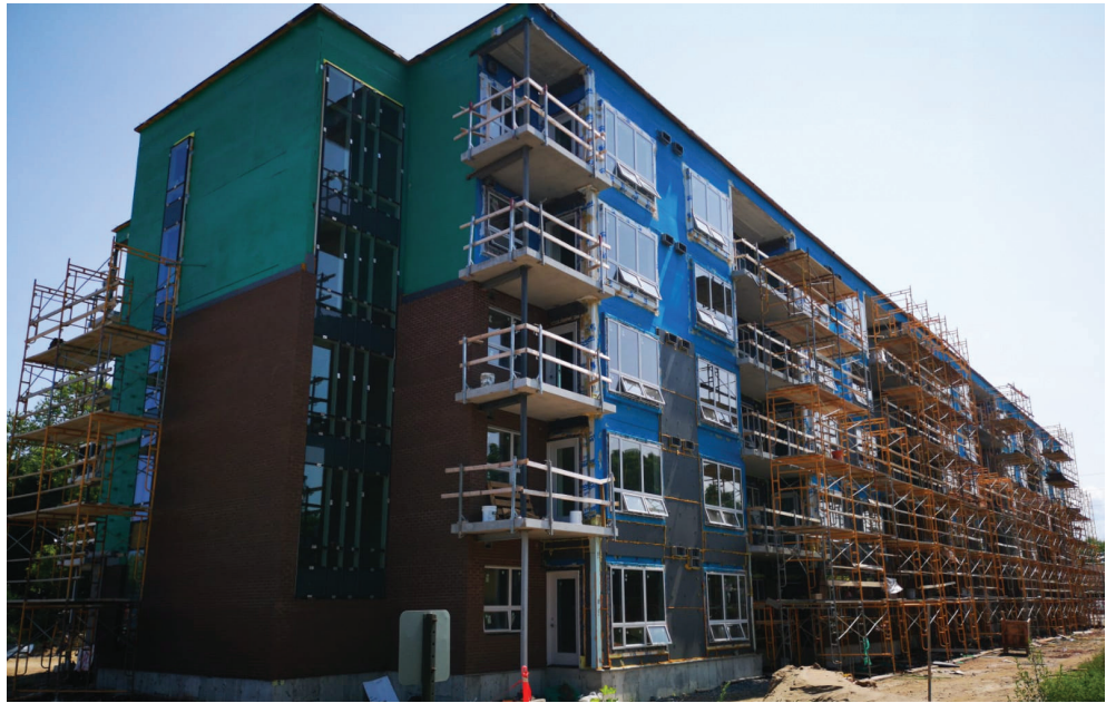
Countdown to Move-in! We look forward to welcoming tenants into our newest build in early 2019