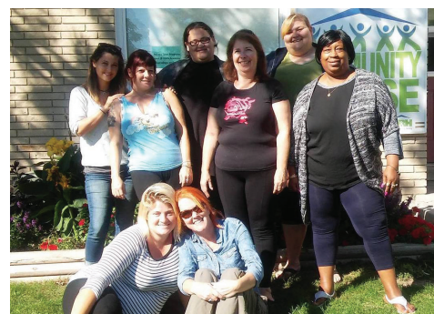
Rykert Volunteer Committee – The Rykert Volunteer Committee (RVC) is made up of current and former tenants, who have joined to bring the Rykert community together through positive, inclusive engagement of families.)