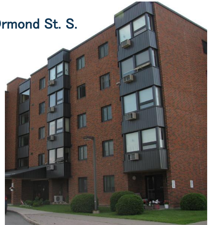
Ormond St. S.