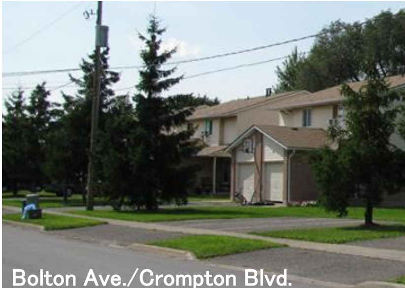
Bolton Ave./Crompton Blvd.