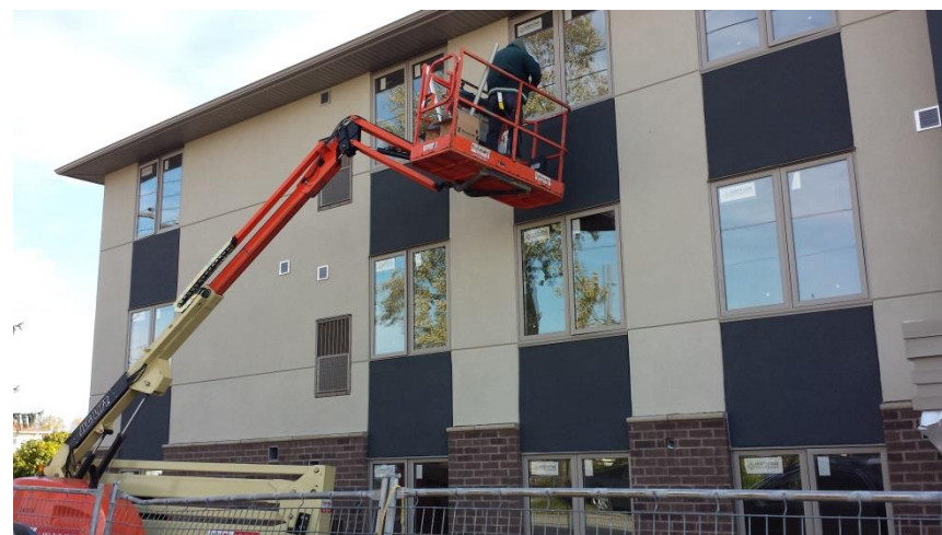
2017 development on Ormond St.