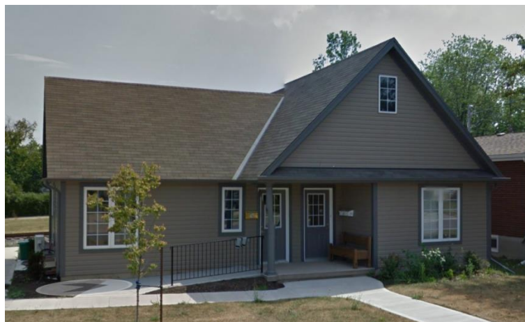
Lyndon St. W.